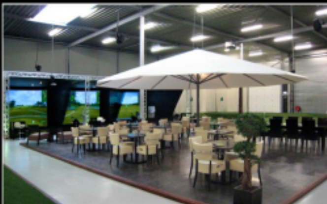
Indoor golf centre

Below a few impressions of installations of the ProTee Golf Simulator and its possibilities.