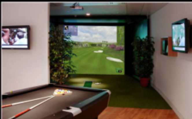
Sports bar / Home